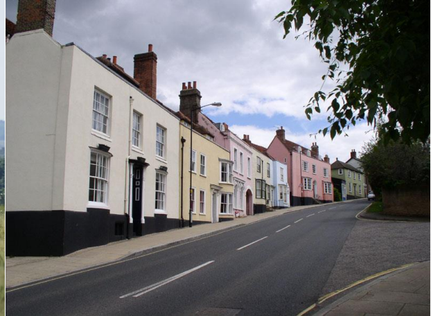
Market Hill, Maldon

Next time we shall discuss Geology and Landscape or why is that hill there, even in 'flat' Essex! This will be on Tuesday 26th July, 2pm. All welcome even if you've never been before. We shall probably take a short trip out to look at the view. If you are out and about, do ask that question about a hill or sudden change in slope. Geology usually has the answer. Please continue to bring your mystery rocks as well.