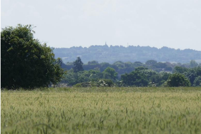
Danbury Hill & church from Broomfield

We continue to meet on the fourth Tuesday of the month. Last month we had a lively session on Black Gold - coal, oil, gas, jet - all things carbon. We discussed the continuing need for hydrocarbons, the technicalities of fracking, which uses well tried and tested oilfield technology, etc. I think that everyone who came was better informed.