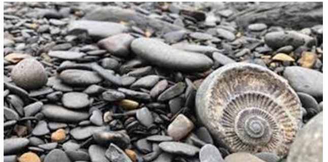
(left - Yorkshire geology; right - Yorkshire pebbles and fossils)

This will be on Tuesday 25th June, 2pm. We look forward to it with great interest.