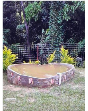
(right - Sulphur pool, Dominica)

Last month we were treated to a fascinating account of life in Dominica amidst its volcanoes, sulphur springs and a boiling lake! These are volcanoes of the nastier type where continental plates collide and produce explosive eruptions with glowing clouds of fragmented rock and hot gases.