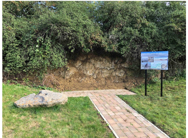
Right: Channels Board in front of cliff & puddingstone